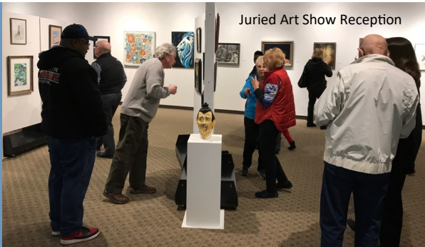
Juried Art Show Reception