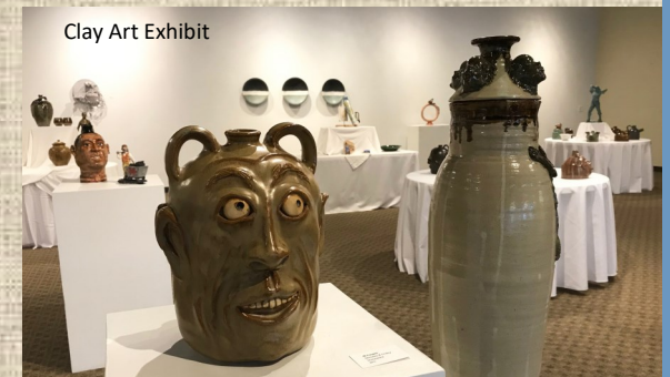
Clay Art Exhibit