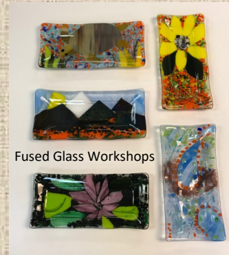
Fused Glass Workshops

We award a yearly scholarship to a Rockmart High school senior who excels in the Visual, Performing or Literary Arts each year.