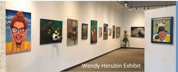
Wendy Herubin Exhibit